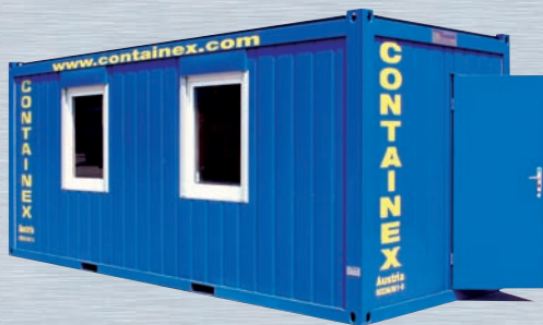
Type BM 20'

A flexible modular system with a variety of equipment options permits individually designed space solutions.