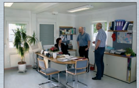
perfect office solution