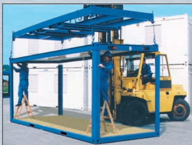
easy D.I.Y. assembly