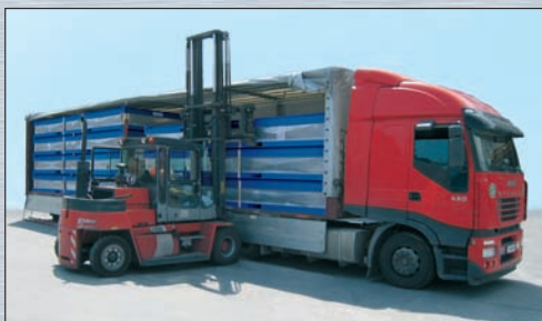
up to 8 cabins per truck