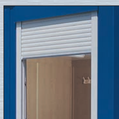
High quality PVC windows with double glazing and roller shutter