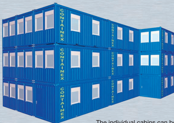
The individual cabins can be linked side by side, end to end or stacked on top of each other