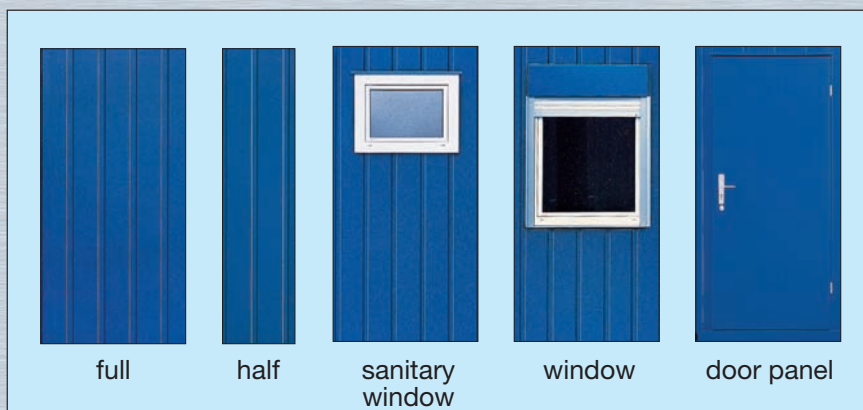
Wall panels can be assembled and dismantled easily and quickly.