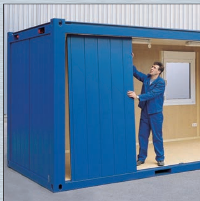
Individual layout options thanks to the panel system